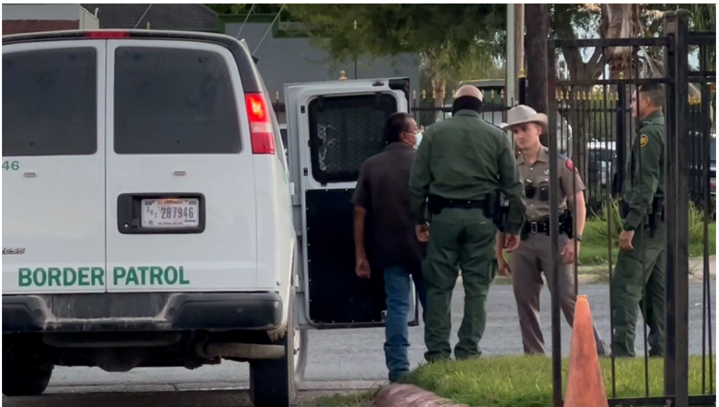
CBP agents detain a person in the Rio Grande Valley.