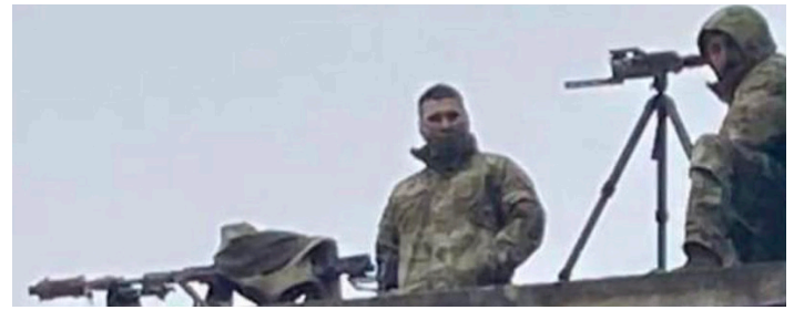
Despite opposition from local activists, CBP has a heavy presence at the annual Mexican-American heritage celebration known as Charro Days. Snipers from local police were placed on rooftops in the Rio Grande Valley during the 2022 Charro Days parade.